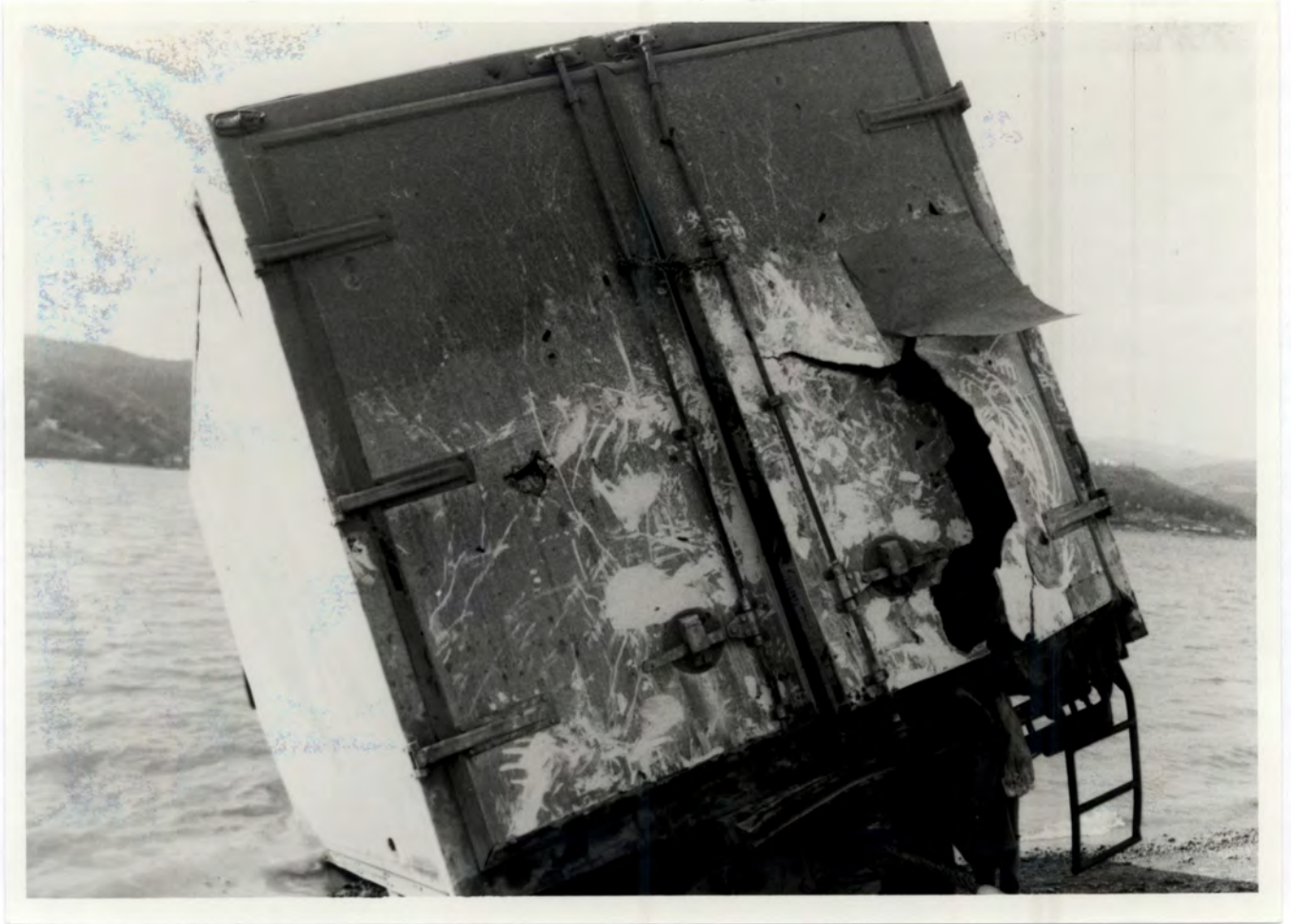
This is a copy of the photograph mentioned in the statement of Captain Dragan KARLEUŠA and referred to as "PHOTOGRAPH JZ-3"