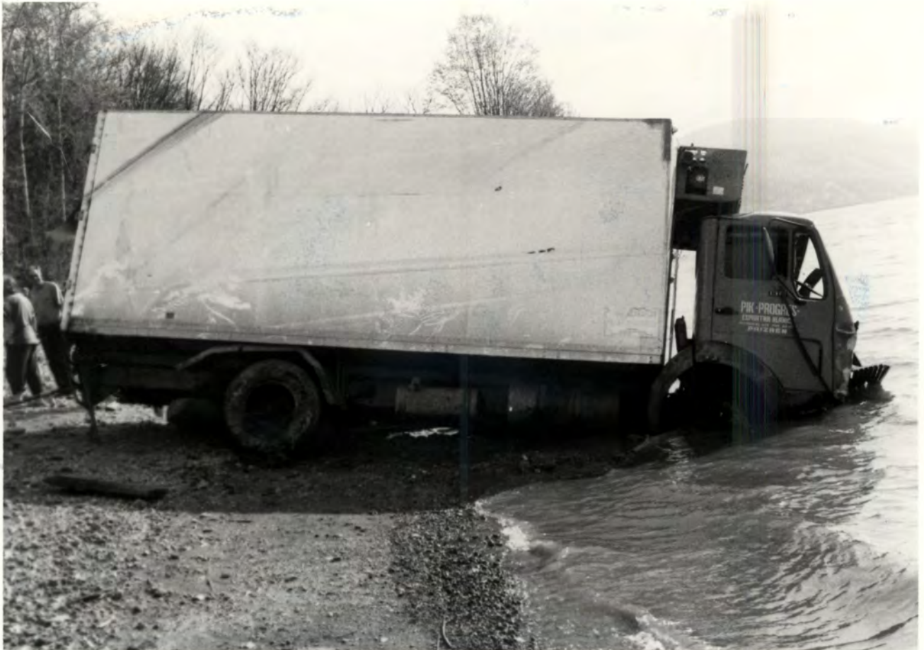
This is a copy of the photograph mentioned in the statement of Captain Dragan KARLEUŠA and referred to as "PHOTOGRAPH JZ-5"